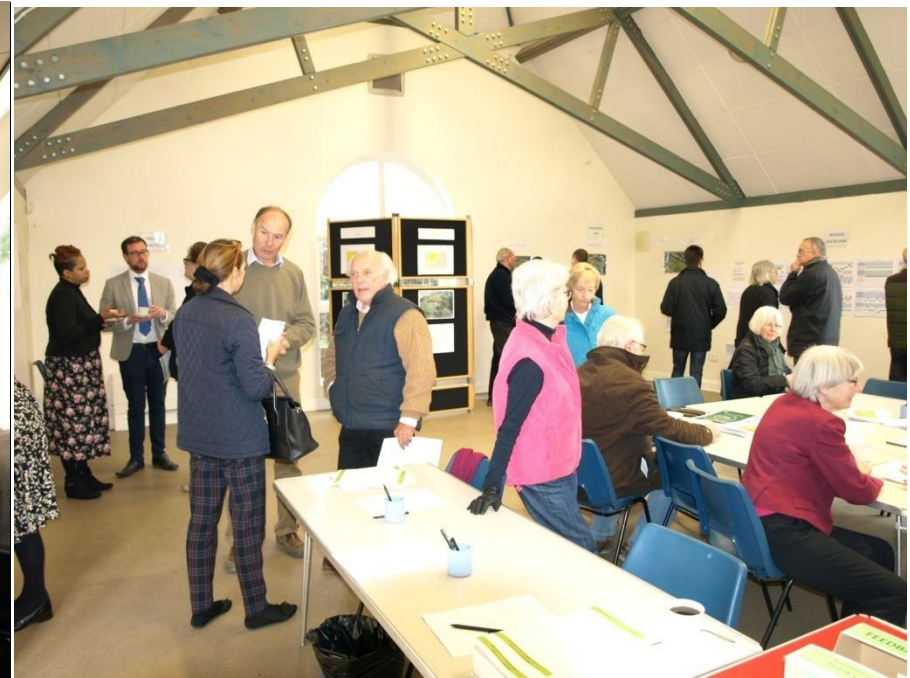
Consultation February 2016