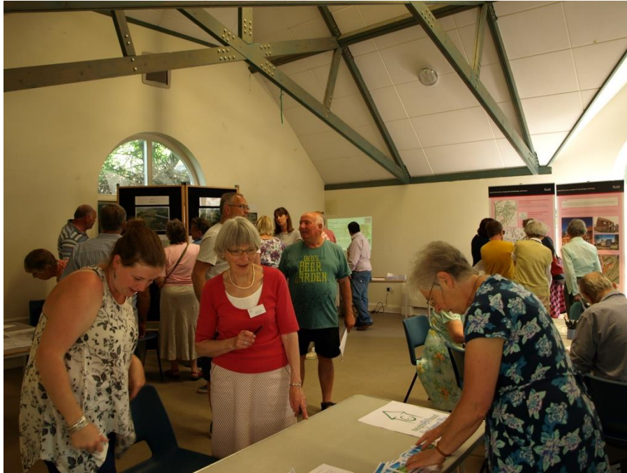
Consultation July 2015