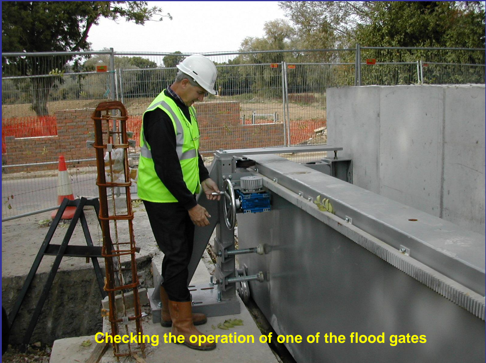
Checking the operation of one of the flood gates