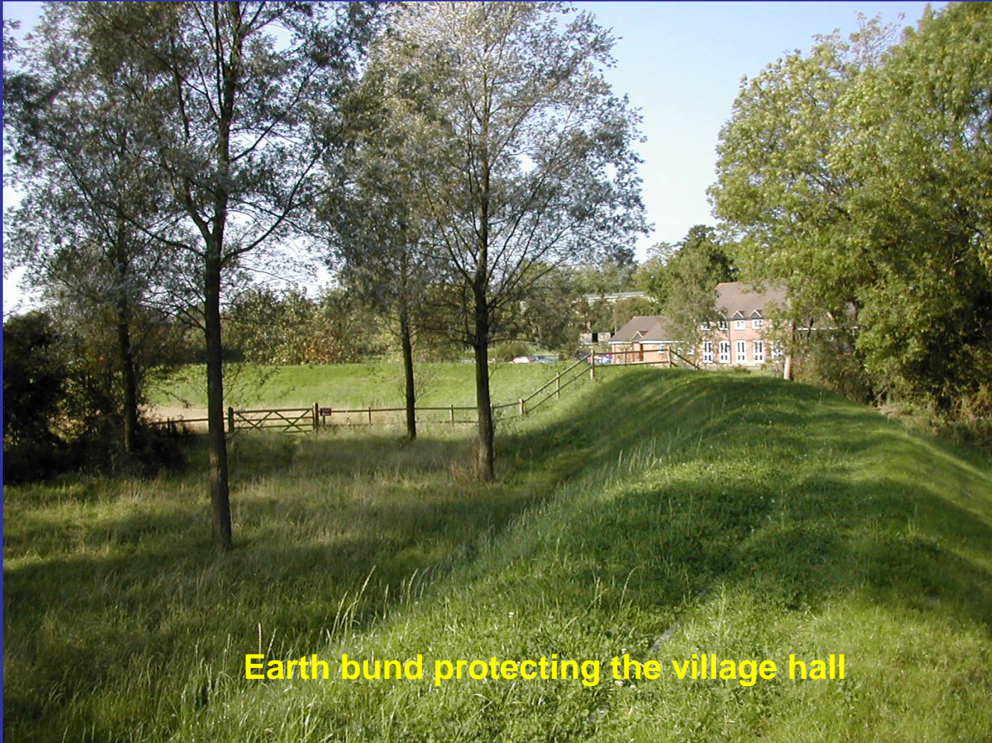
Earth bund protecting the village hall

After nearly a year and a good growing season, the landscaping of the works area is starting to blend the defences into the landscape.