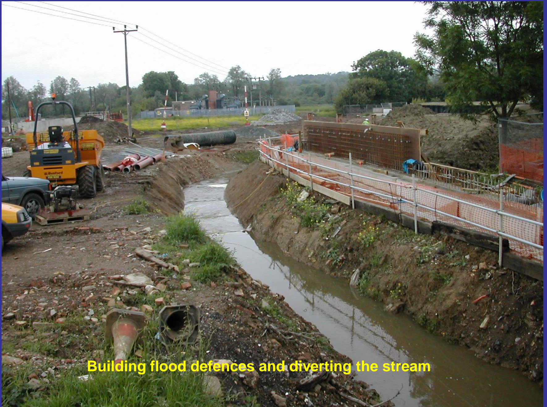
Building flood defences and diverting the stream