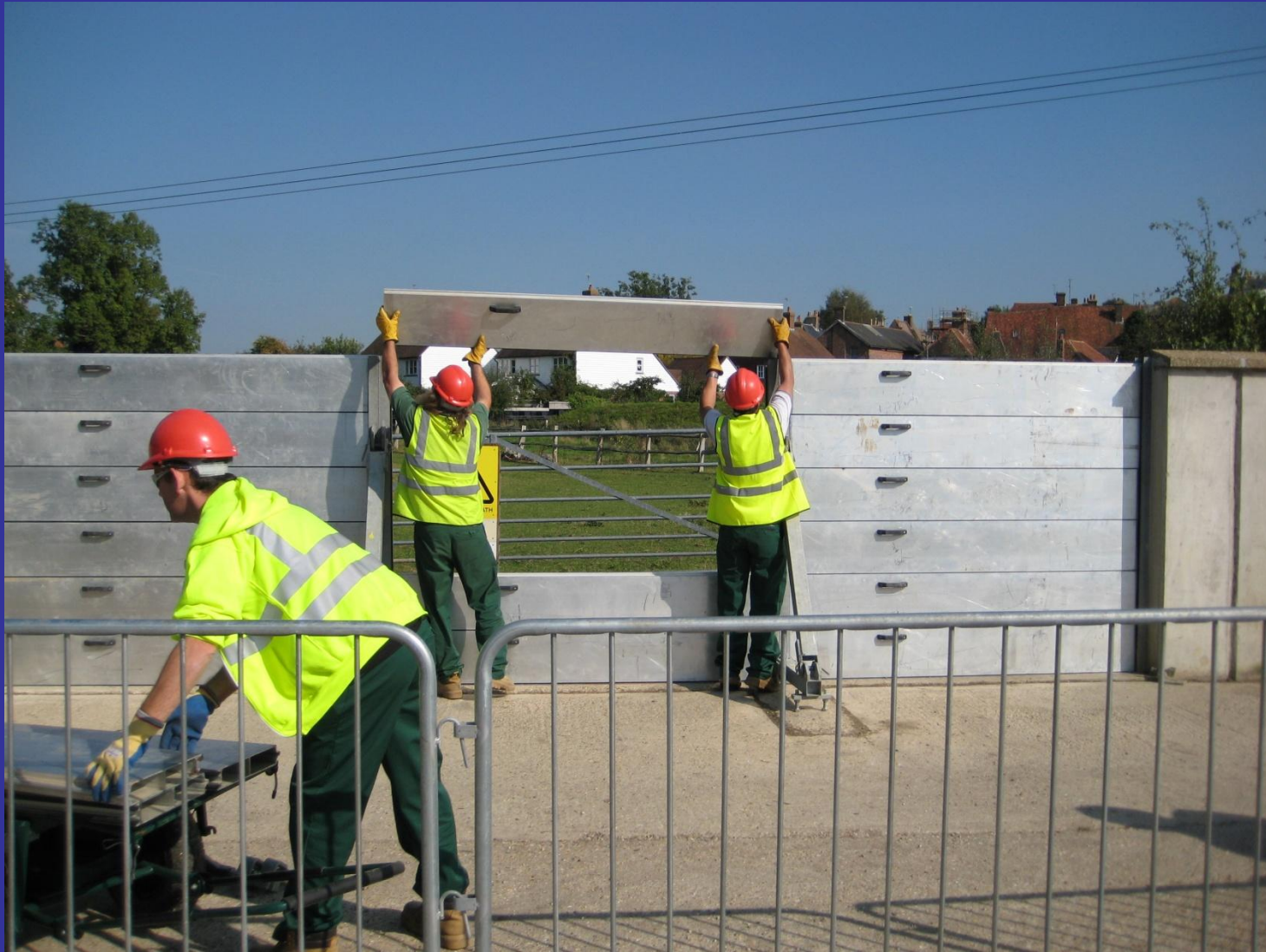
Installing one of the demountable 'stop log' barriers