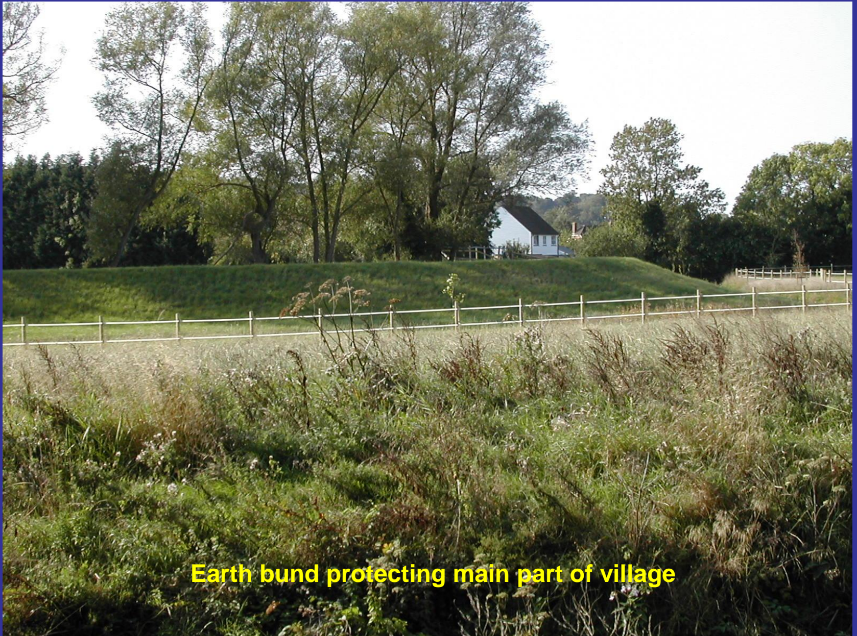
Earth bund protecting main part of village