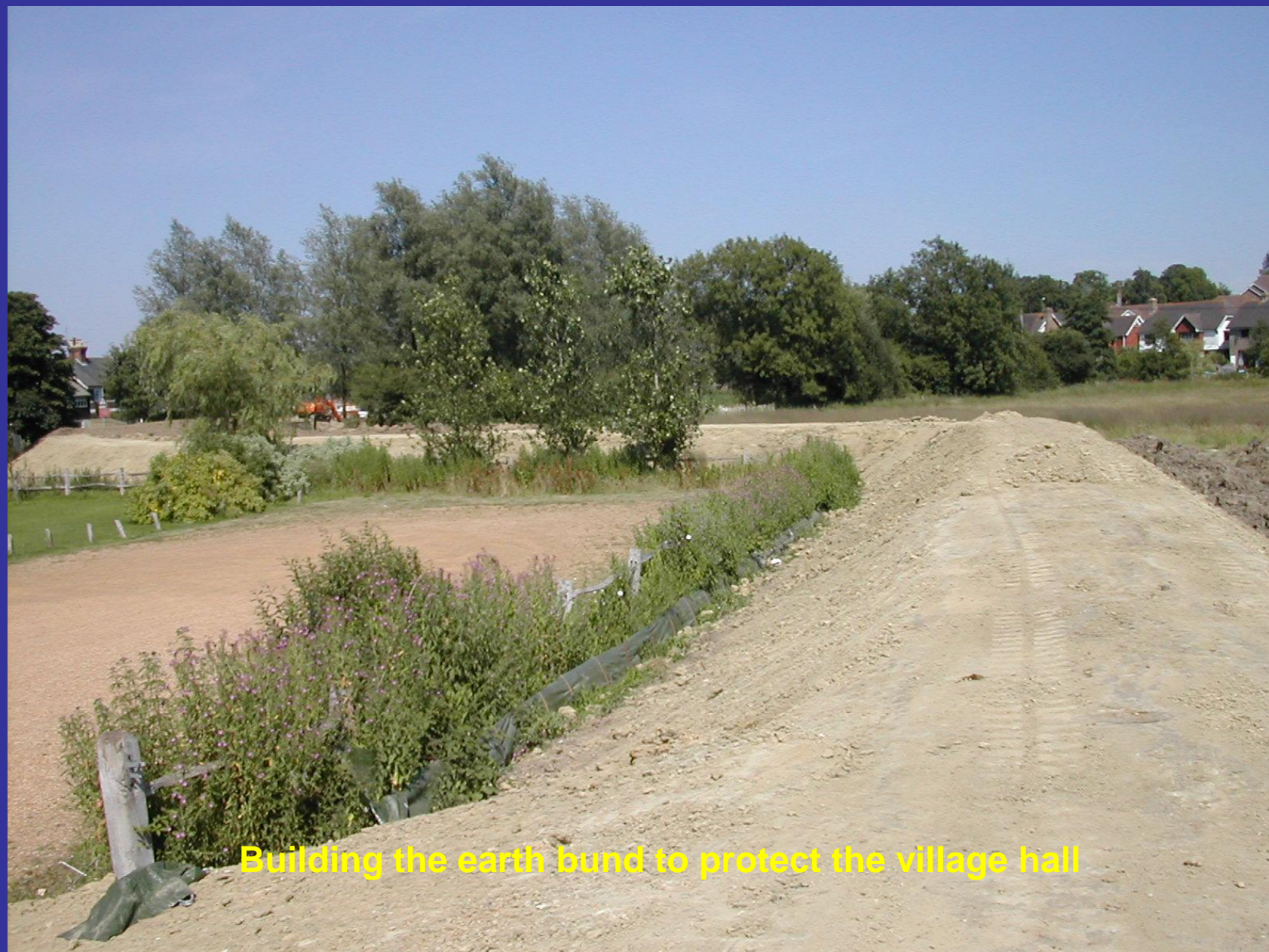
Building the earth bund to protect the village hall