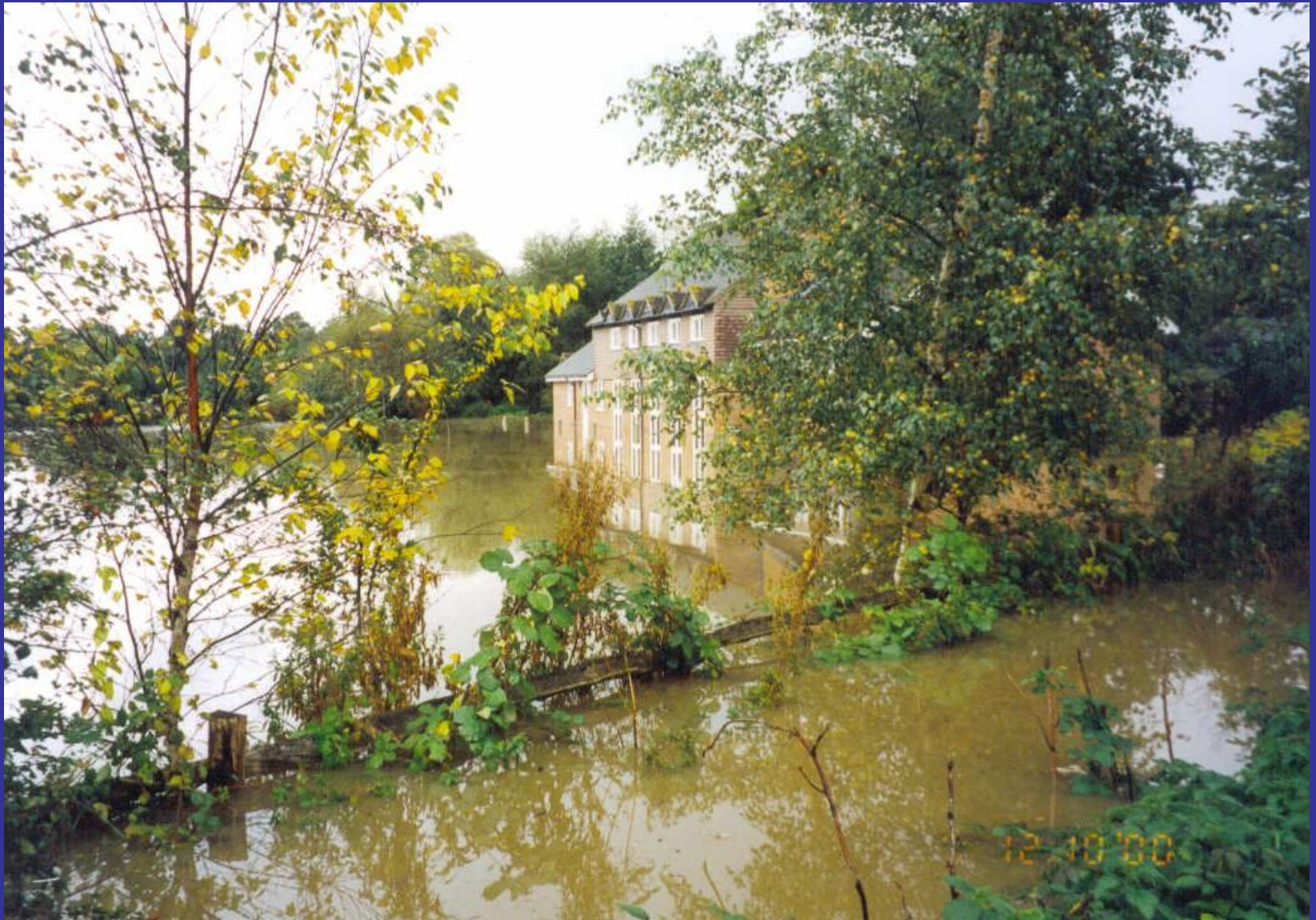
The village hall!