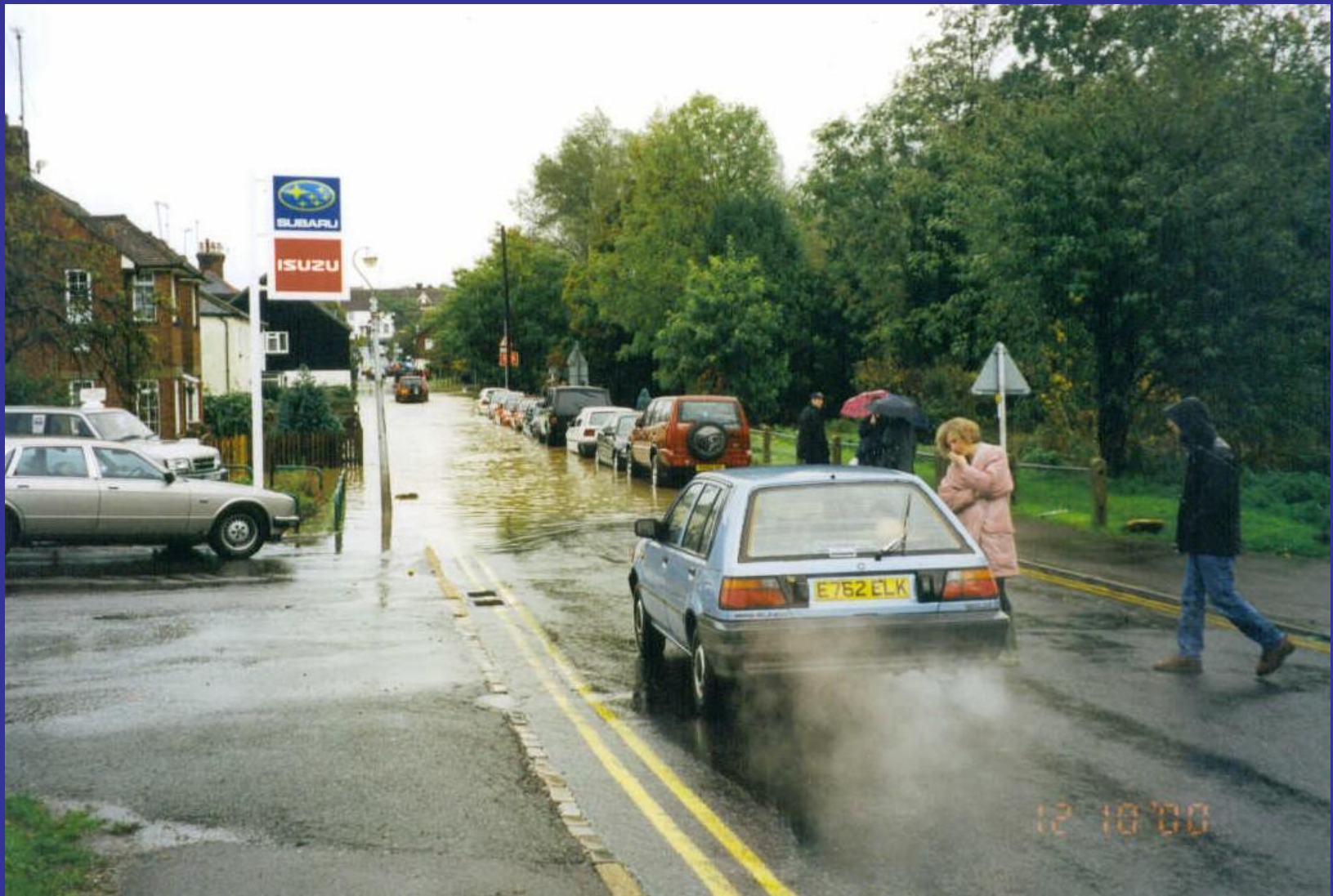
Thursday 12 th October 2000 – Down came the rain!