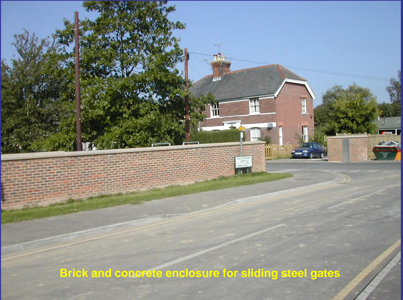
Brick and concrete enclosure for sliding steel gates