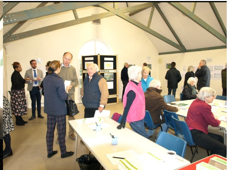
Consultation February 2016