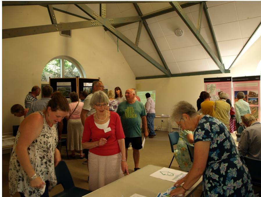
Consultation July 2015