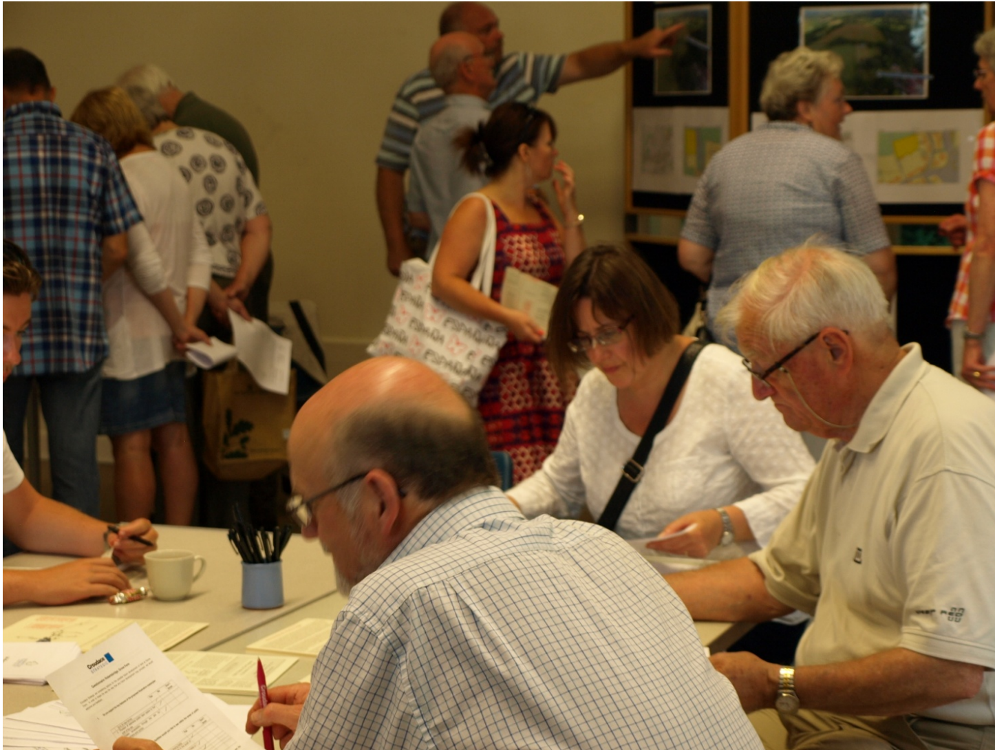
People at July 2015 Exhibition